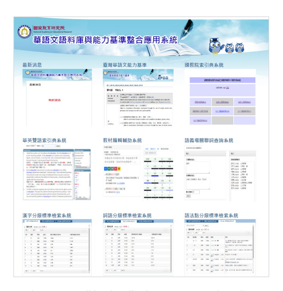
Figure 3: COCT and TBCL consolidated application system, URL: https://coct.naer.edu.tw/

The consolidated application system encompasses 14 online query systems, including: (1)" Chinese Character Grading Scales Query" (2) "Word Grading Scales Query" (3) "Basic Word Query" (4) "Grammar Grading Scales Query" (5) "Affixes Scales Query" (6) "NAER Thesaurus" (7) "Teaching Materials Editing Assistance System" (8) "Chinese Semantic Field Conjunctive Word Query" (9) "Automatic Correction for Typos in Chinese Compositions" (10) "NAER Word Tokenization System" (11) "Calculation System of Word Coverage Rate in Corpus" (12) "Comparative Tools for Word List" (13) "Chinese Interlanguage Thesaurus" (14) "Chinese-English Bilingual Thesaurus". For the guide of the 14 systems of and links to these systems please see pp. 32-33 of THE GUIDELINES where information such as Chinese language teaching, teaching material design, testing and evaluation, and research applications are provided.