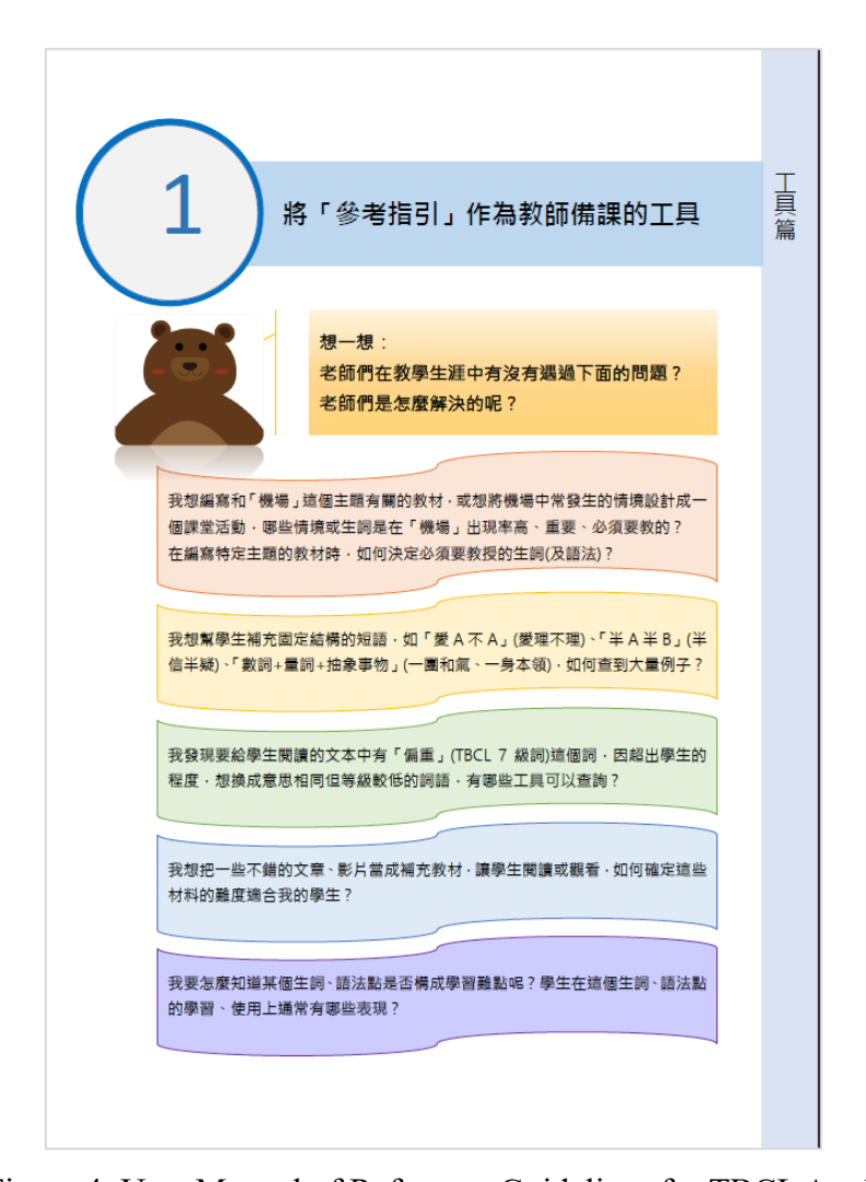
Figure 4: User Manual of Reference Guidelines for TBCL Application

To help users implement the principles of THE GUIDELINES in their Chinese language teaching and apply THE GUIDELINES, in 2022, NAER compiled a user manual, providing illustrations and examples on how to use THE GUIDELINES in practical teaching. The contents of the manual cover three aspects, knowledge, implementation, and tools, all of which offer reference materials for teaching practice such as course planning, teaching material design, lesson plans and teaching activities to various professions such as, Chinese language instructors, teaching material editors and other professions.